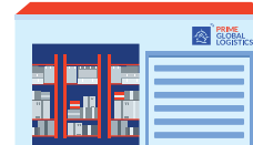
PERTH WAREHOUSE #1