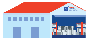
NEW PERTH WAREHOUSE #2

4,300 SQM Warehouse 3,500 SQM Hard Stand